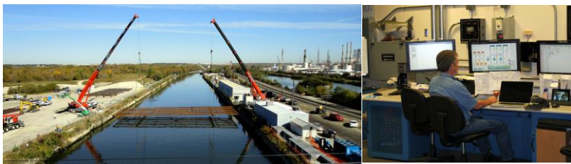
Figure 6: Barrier Construction and Control Room

The time to design such a barrier is estimated to take 17-months with construction needing about 7-months. This gives the carp plenty of time to move upstream, which they will. Because of the uncertainty of their presence, and another 2-years to migrate, it only makes sense to stop migration in the most certain place possible. I have little doubt they will be in Guntersville in two years. Thus, any barrier at the lock into Guntersville Lake from Wheeler Lake will be too late. Ideally, Nickajack Lock and Chickamauga Lock would be outfitted at the same time, and Watts Bar Lock next. It is essential for TWRA to continually perform populations studies in Guntersville, Chickamauga, and Nickajack to confirm presence or absence of the carp. This is necessary to determine which lock(s) are outfitted. Only in this way can we be certain migration is stopped.