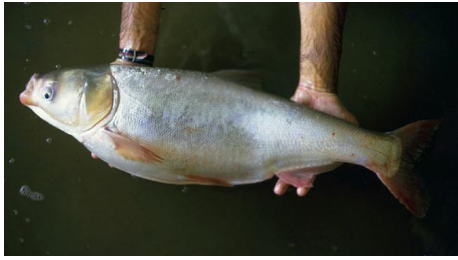
Figure 1: Silver Carp

Silver Carp are planktivorous filter feeders, meaning they merely swim with their mouths open and consume whatever is floating in the water column, primarily phytoplankton and zooplankton. They can filter out 20-40% of their body weight each day which represents millions of planktonic organisms. They are so efficient they have been used in sewage treatment ponds to reduce and remove algal blooms.