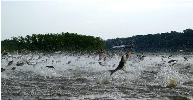
Figure 5: Pontoon Boat Amidst Jumping Silver Carp

Carrying capacity refers to the maximum population size of a species that the aquatic ecosystem can sustain indefinitely and is based on the food, habitat, water quality and other