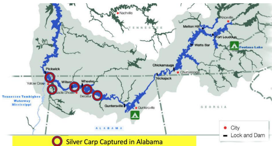
Figure 4: Alabama Presence of Silver Carp

The figure above shows the distribution in Tennessee, but is likely to be out of date. The fish will effectively move upstream to every river system and tributary unless there is no lock at a dam. Without effective control measures, nearly the entire map above will be red.